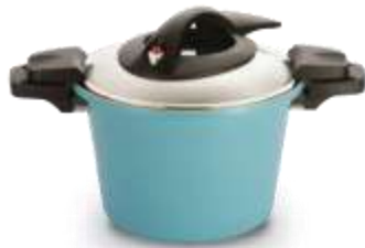
Low pressure cooker

EK-RD-L26 26cm (10") 3.3L (3.5qt) Glass lid